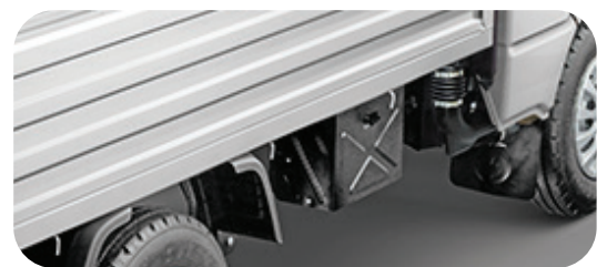
LOCKABLE BATTERY COVER