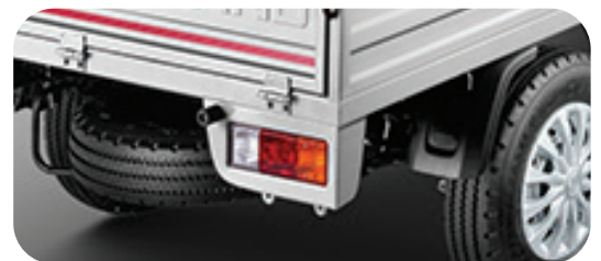
TAIL LAMP PROTECTOR